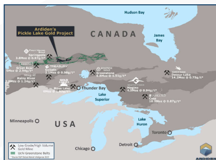
Figure 1– Location of Ardiden’s Pickle Lake Gold project within the Uchi Belt of northwest Ontario 1 .