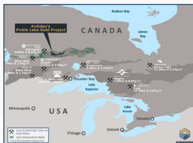
Figure 1– Location of Arden's Pickle Lake Gold project within the Uchi Belt of northwest Ontario 1 .